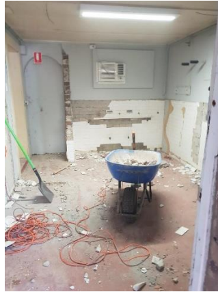
Day 1 start of fitout

Construction of 3rd Studio - Total planned expense - $48k - construction, alarm upgrade, electrical work, equipment & fitout, signage & marketing,