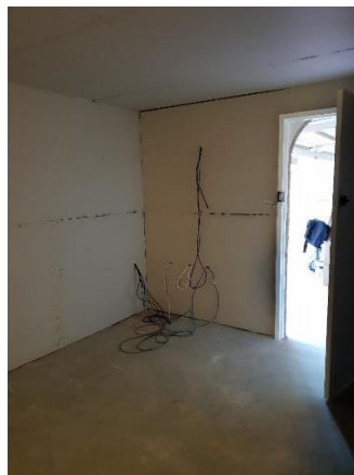
Waiting for that all important cable which has now been installed. Here's the latest update.

Construction of 3rd Studio - Total planned expense - $48k - construction, alarm upgrade, electrical work, equipment & fitout, signage & marketing,