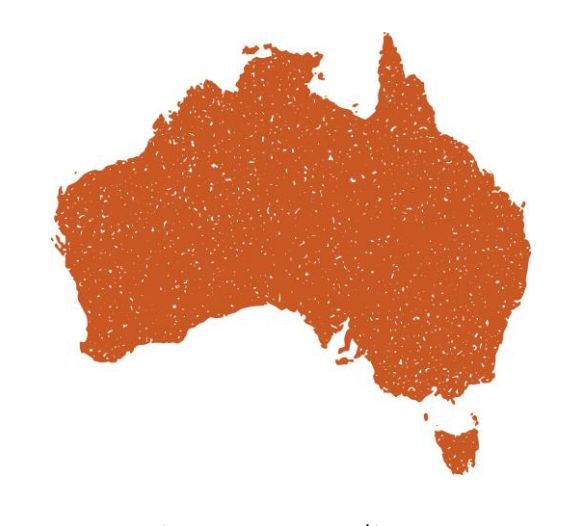
1 in 4 Australians listen to community radio every week Approximately 5.8 million Australians