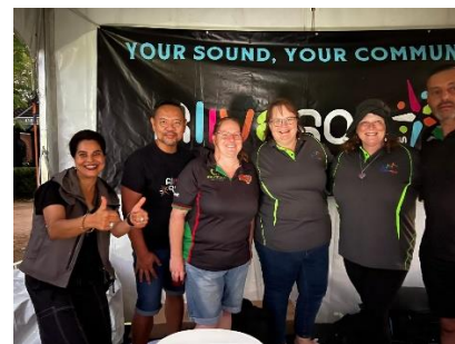
The team in action

Alive 90.5FM was live on site at Holroyd Gardens for the Australia Day 2023 Event in conjunction with Cumberland Council.