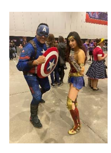
Adults love dressing as Super Heroes just as much as kids, I think