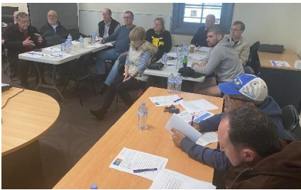
Here is our latest group of legal eagles