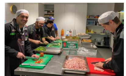
Alive90.5 FM team at Ronald McDonald House

The Alive 90.5FM team successfully delivered an outside broadcast and charity cook at Ronald McDonald House Greater Western Sydney in Westmead on Monday May 31, 2021.