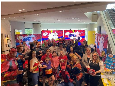
The Gang at the Super Tee OB