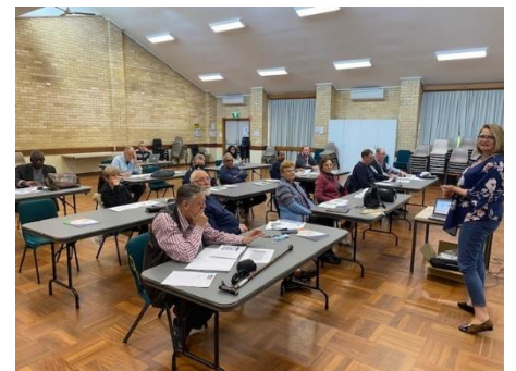
Interested attendees paying attention