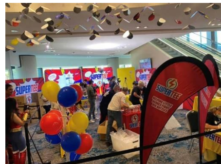
A party atmosphere was greatly enjoyed