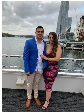
Check out that ring!